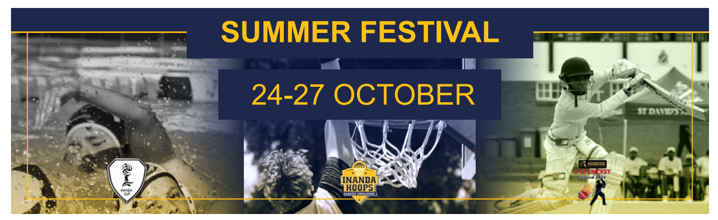
Friday 25 October 2024