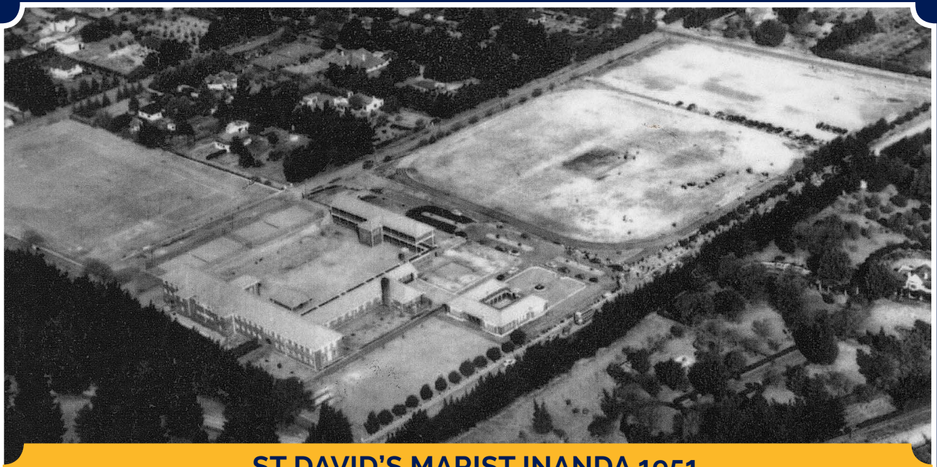
ST DAVID'S MARIST INANDA 1951