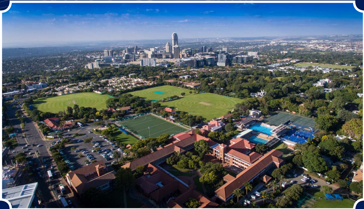
ST DAVID'S MARIST INANDA 2024