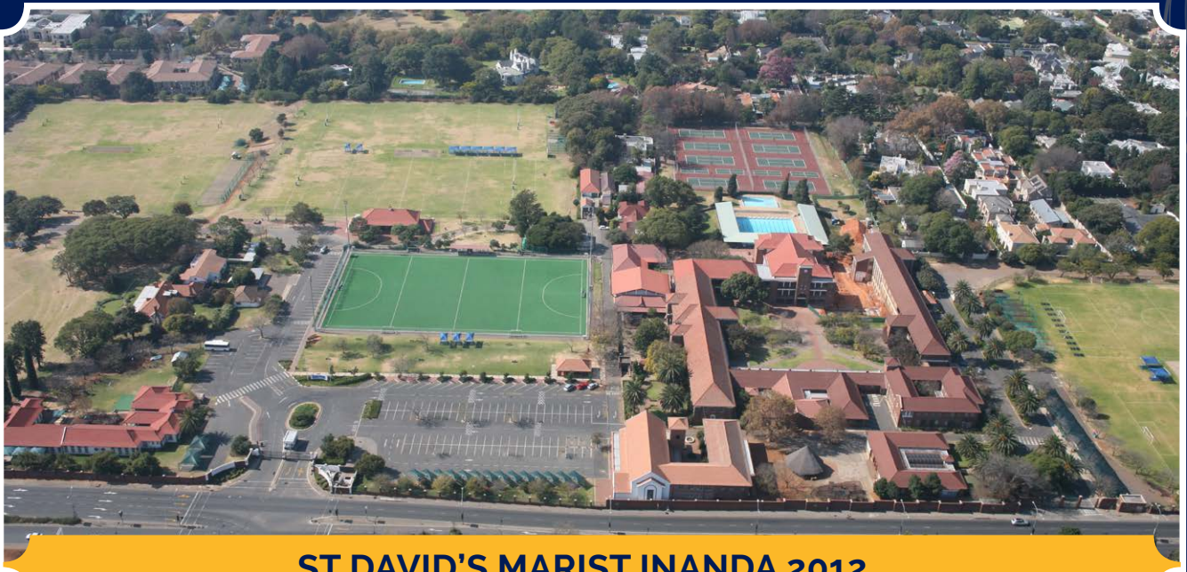
ST DAVID'S MARIST INANDA 2012

Our Marist DNA of daring and bravery positions us to take the step into a new educational model reaching beyond just these buildings and the fences that circle our beautiful campus.